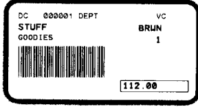
Zebra Split Label Part #800127-101